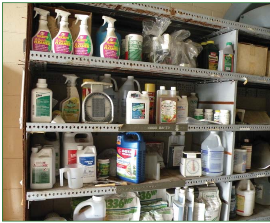
Any pesticides kept on school grounds should be stored in locked areas accessible only to properly trained and licensed professionals.

For over two decades, schools have been using IPM to reduce pesticide use and associated costs. In 1985, the Montgomery County Public Schools in Maryland made 5000 pesticide applications. Just three years later, after transitioning to IPM practices, only 600 pesticide