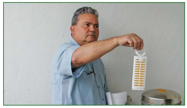
Ineffective pest control can lead to staff resorting to over-the-counter pesticides to try to resolve persistent problems. In this case, staff frustrated with flies in a loading dock area have hung a pesticide strip (dichlorvos). Cleaning the organic matter out of loading dock drains, and keeping them clean, eliminated the breeding site and the flies.

When needed, pesticide products can be selected that minimize risks to students and staff (Green and Gouge 2008). Many states have laws requiring parental notification prior to pesticide applications, as well as posting pesticide application warnings at applications sites (Owens 2010).