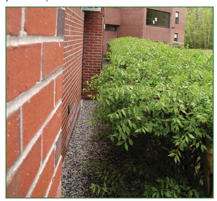
Vegetation is trimmed away from the building to prevent ants and other pests from travelling onto the structure. A concrete or stone mulch strip placed along the perimeter excludes ground vegetation that can conceal pests and pest activity.

According to the 2006 report, Greening America's School: Costs and Benefits (Kats), green-building practices yield savings of around $70 per square foot in energy costs, greater staff productivity, and improved student and staff attendance. Incorporating IPM into green schools is a natural fit contributing to lower costs and higher productivity.